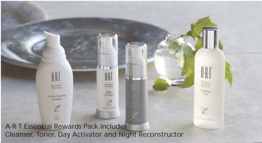
A-R-T Essential Rewards Pack includes Cleanser, Toner, Day Activator and Night Reconstructor

Vitamin C is combined with Matrixyl, to produce a 50% greater increase in skin matrix regeneration than the Peptide Complex alone. 2